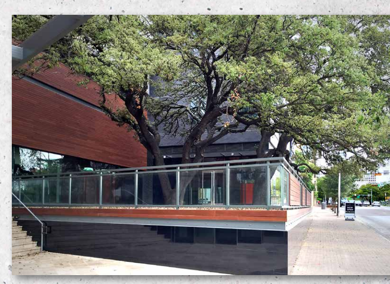
Green Water Block 23 project in Austin, Texas. Diamond Pier selected to protect Heritage Trees.