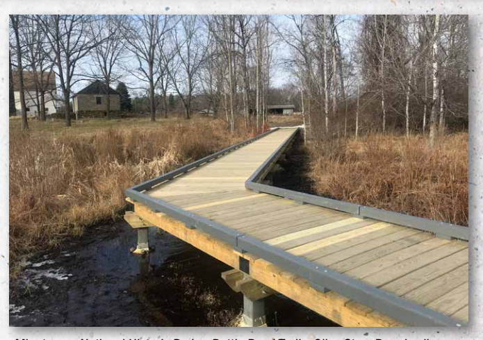
Minuteman National Historic Park – Battle Road Trail - Olive Stow Boardwalk

Call 253-858-8809 or visit... www.DiamondPiers.com