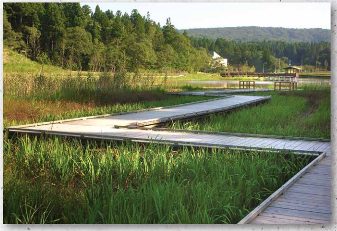
The low impact installation of Diamond Pier Foundations is ideal for bringing visitors to ecologically sensitive and captivating environments.