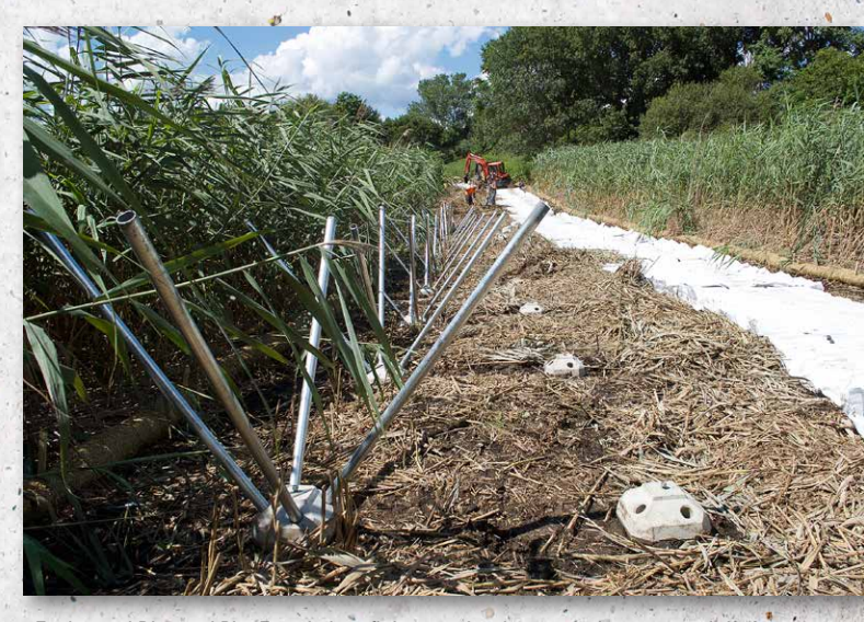
Engineered Diamond Pier Foundations fit into any low impact design strategy, bringing an environmental solution to a wide variety of construction sites.