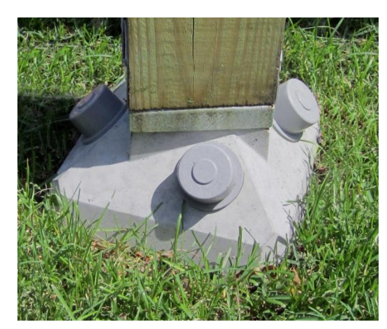
Figure 7. Completed Installation with Pin Caps