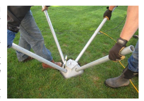
Figure 4. Setting Pins and Leveling Pier

minimize flaking of the concrete surface or deformation of the end of the pin (see Note 1 ). With the pin driving hit installed on the automatic hammer, and another crew member hold