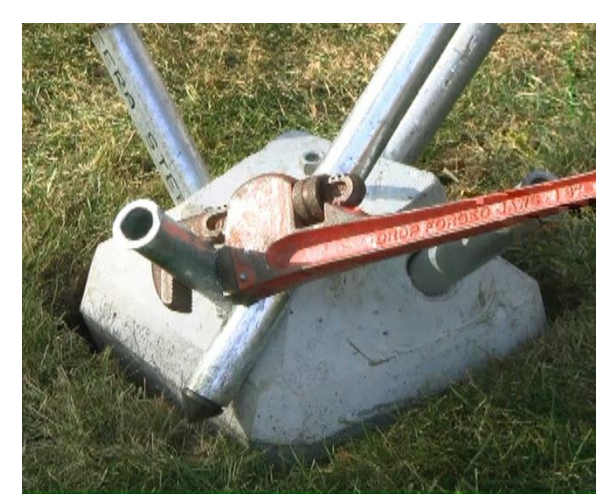
Figure 6. Jacking Method for Pin Removal

Note 1: For the first 4" of removal use the flat bar with the pipe wrench. After the pin is 4" removed you may use a pin as a pry bar.