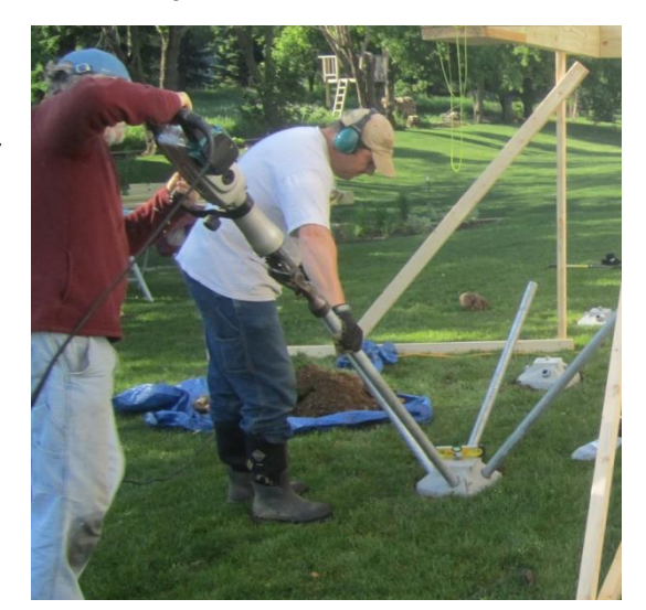
Figure 5. Driving Pins with Auto-hammer and Pin Driving Bit

Note 3: Do not continue to hammer away at a pin that is bouncing, rattling, or scraping against an impassable