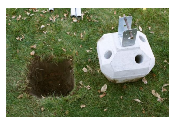
Figure 3. Tapered Hole for Concrete Head

*The pier may also be buried for aesthetic considerations, but access to the top of the pier needs to be maintained. Concrete slabs, patios, and other products installed MUST NOT interfere with the Diamond Pier foundation and the attached post/beam assembly. Expansion joints may be used to protect the foundation. Proper drainage must also be maintained.